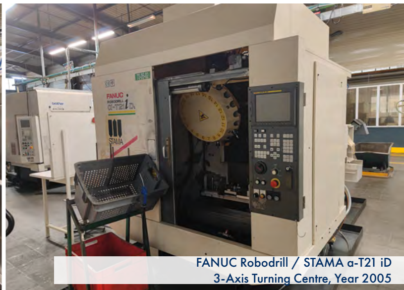
FANUC Robodrill / STAMA a-T21 iD 3-Axis Turning Centre, Year 2005

ONLINE AUCTION CLOSING 7th JUNE MORE INFORMATION ON WWW.MAYNARDEUROPE.COM | EMAIL: INQUIRY@MAYNARDS.COM