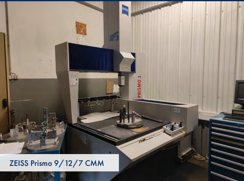
ZEISS Prismo 9/12/7 CMM