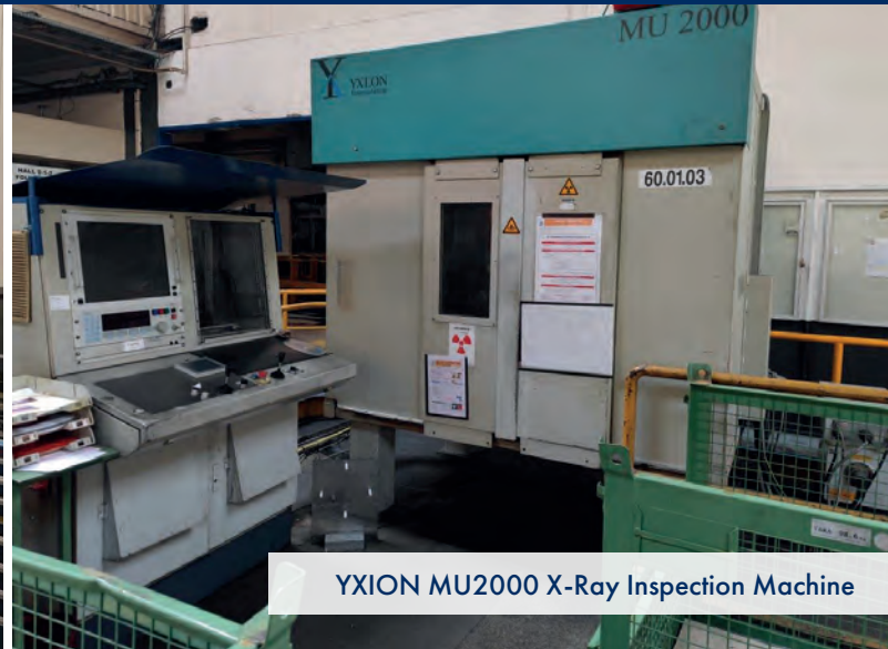
YXION MU2000 X-Ray Inspection Machine