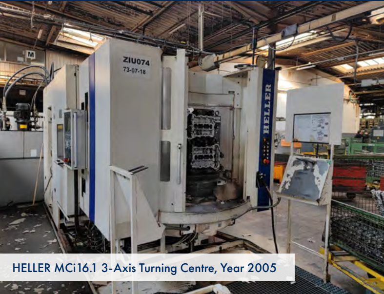
HELLER MCi16.1 3-Axis Turning Centre, Year 2005