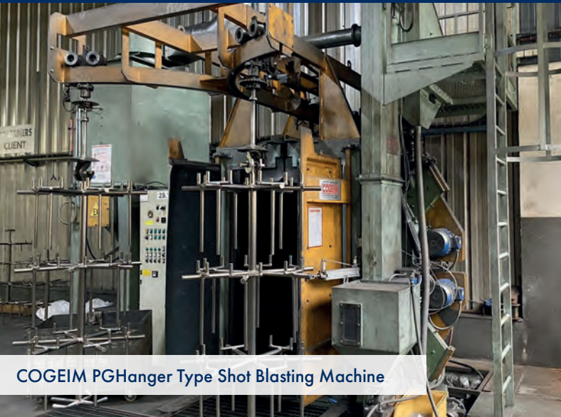
COGEIM PGHanger Type Shot Blasting Machine