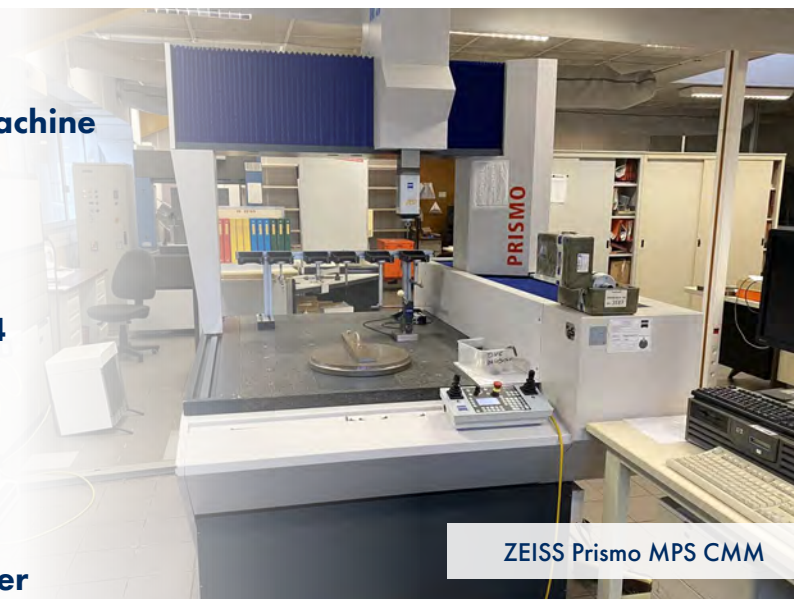
ZEISS Prismo MPS CMM

ONLINE AUCTION CLOSING 7th JUNE MORE INFORMATION ON WWW.MAYNARDEUROPE.COM | EMAIL: INQUIRY@MAYNARDS.COM