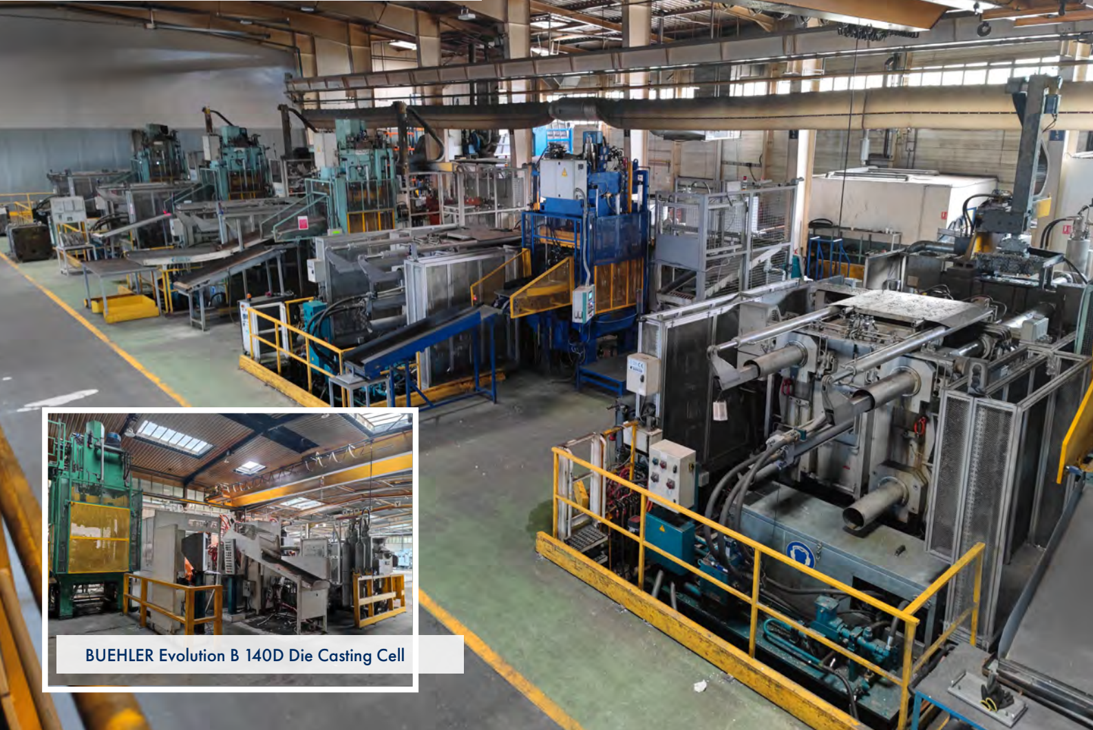
BUEHLER Evolution B 140D Die Casting Cell