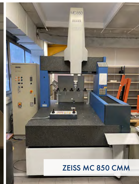
ZEISS MC 850 CMM