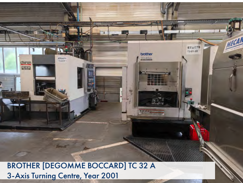
BROTHER [DEGOMME BOCCARD] TC 32 A 3-Axis Turning Centre, Year 2001