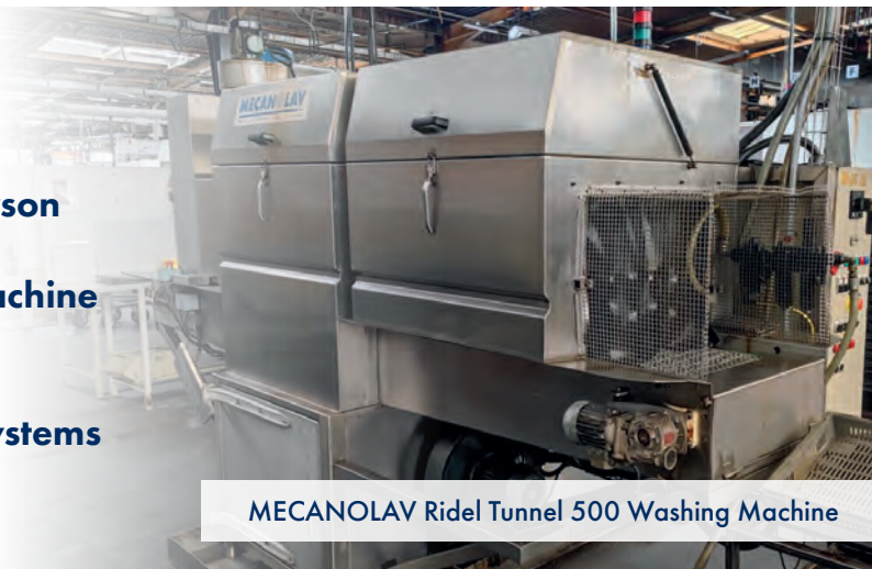
MECANOLAV Ridel Tunnel 500 Washing Machine