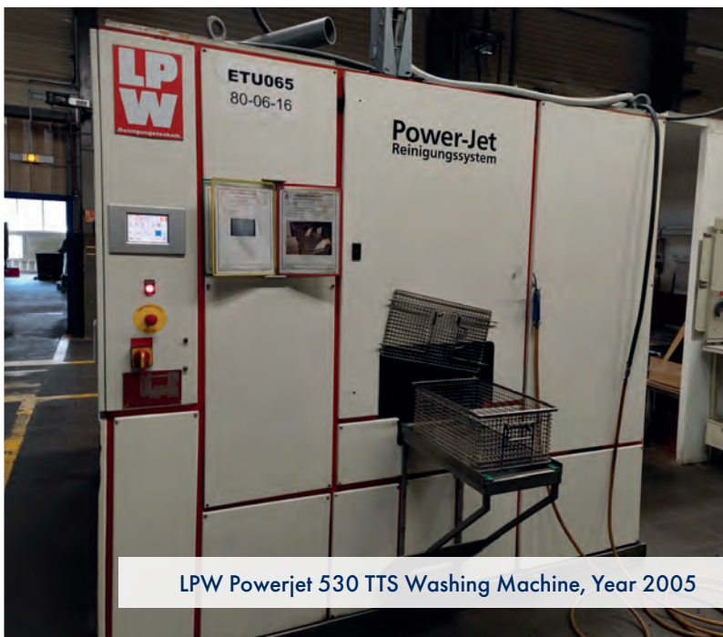
LPW Powerjet 530 TTS Washing Machine, Year 2005

ONLINE AUCTION CLOSING 7th JUNE MORE INFORMATION ON WWW.MAYNARDEUROPE.COM | EMAIL: INQUIRY@MAYNARDS.COM