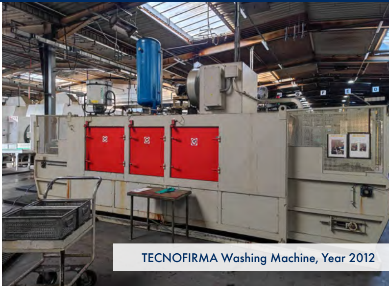
TECNOFIRMA Washing Machine, Year 2012