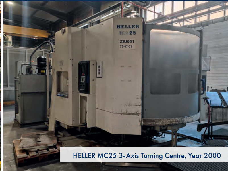
HELLER MC25 3-Axis Turning Centre, Year 2000