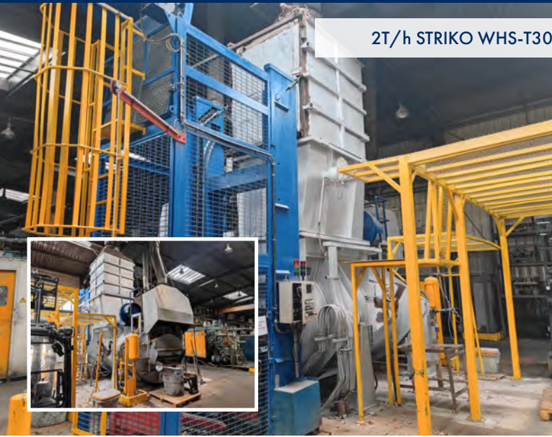
2T/h STRIKO WHS-T3000/2000 Melting Ovens