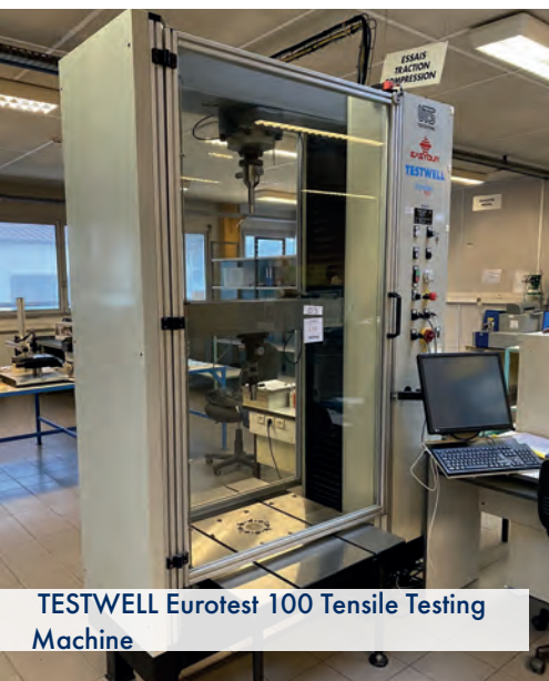
TESTWELL Eurotest 100 Tensile Testing Machine