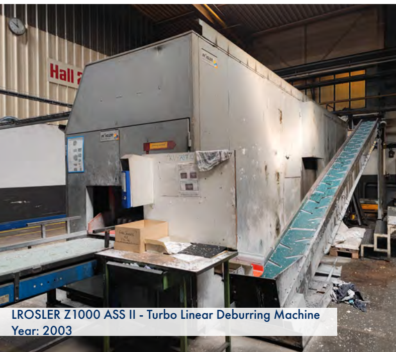
LROSLER Z1000 ASS II - Turbo Linear Deburring Machine Year: 2003