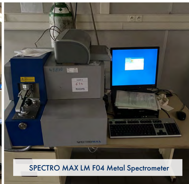
SPECTRO MAX LM F04 Metal Spectrometer