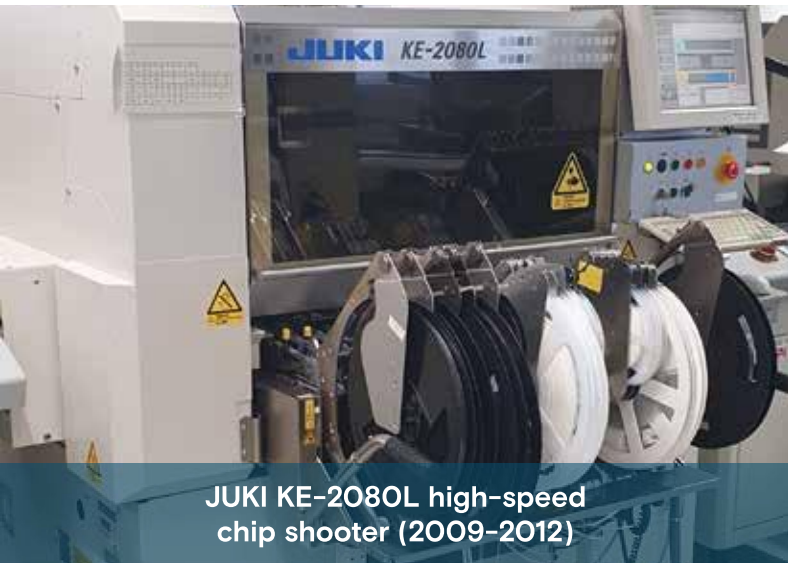
JUKI KE-2080L high-speed chip shooter (2009-2012)