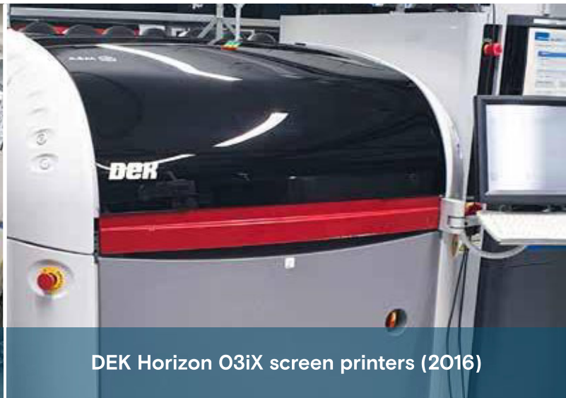
DEK Horizon O3iX screen printers (2016)