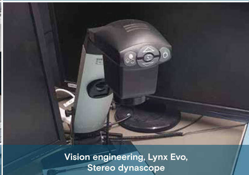
Vision engineering, Lynx Evo, Stereo dynascope