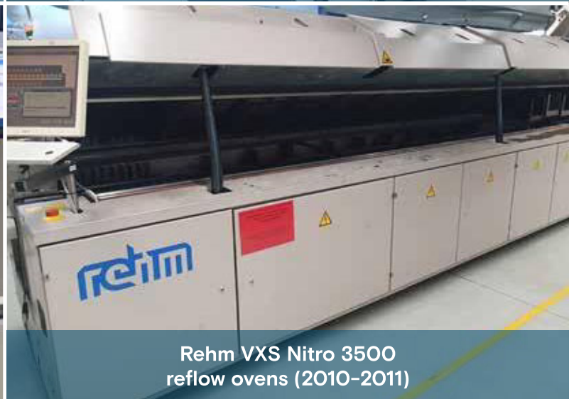
Rehm VXS Nitro 3500 reflow ovens (2010-2011)