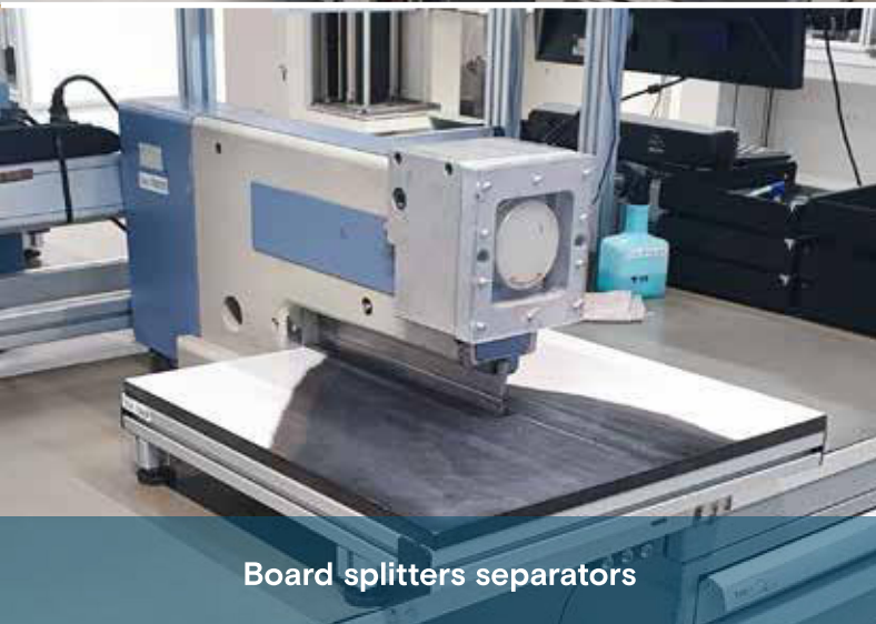
Board splitters separators