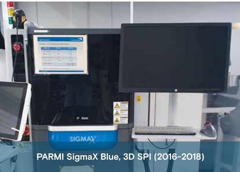
PARMI SigmaX Blue, 3D SPI (2016-2018)