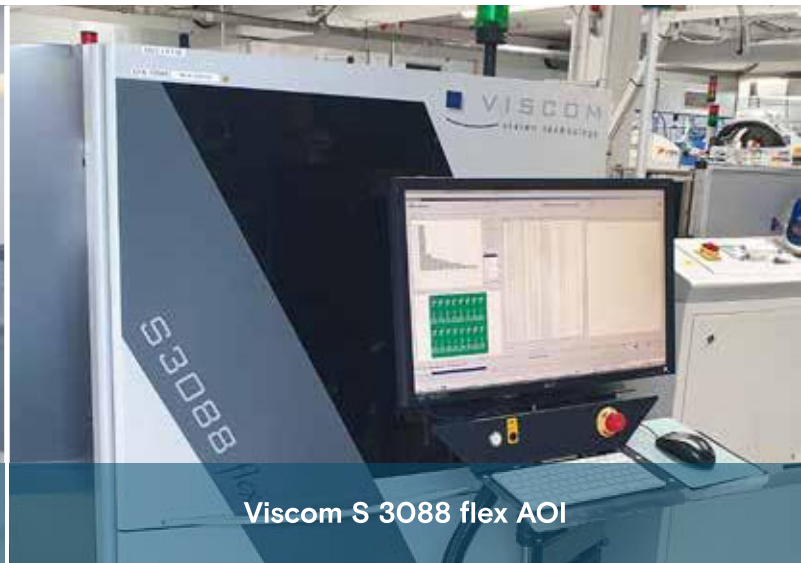
Viscom S 3088 flex AOI