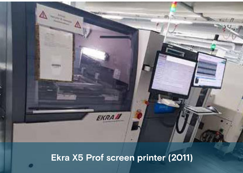
Ekra X5 Prof screen printer (2011)