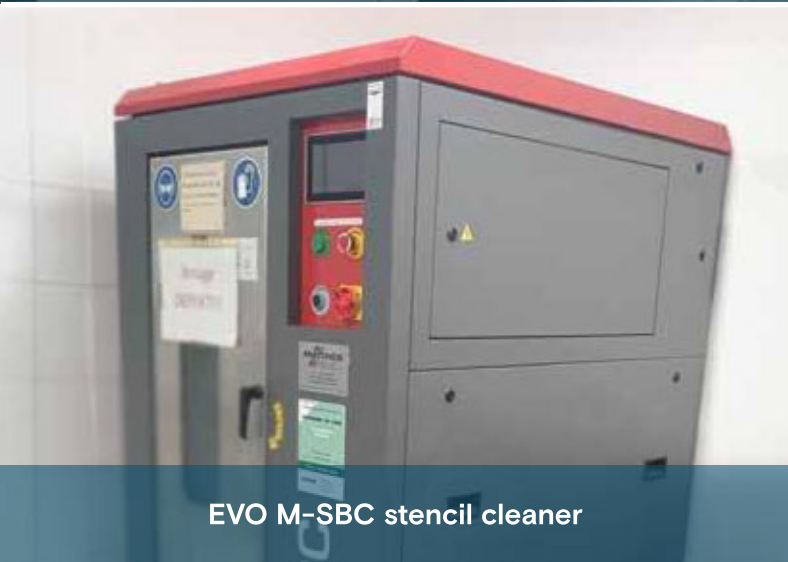
EVO M-SBC stencil cleaner