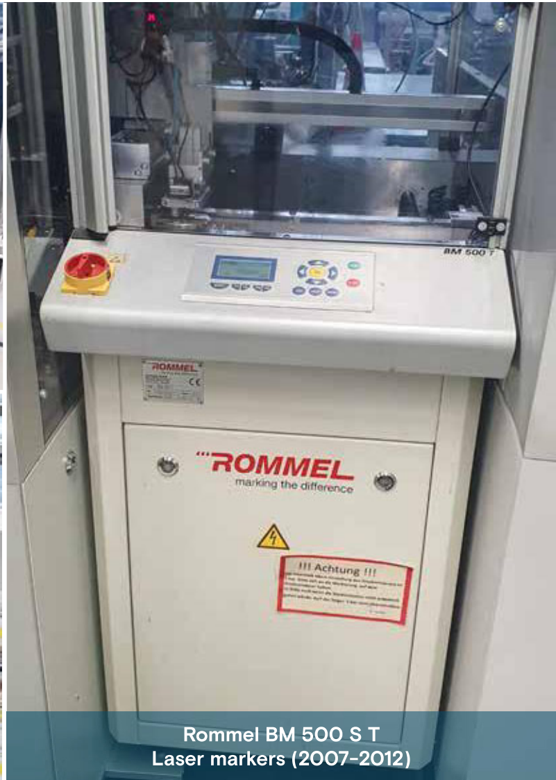
Rommel BM 500 S T Laser markers (2007-2012)