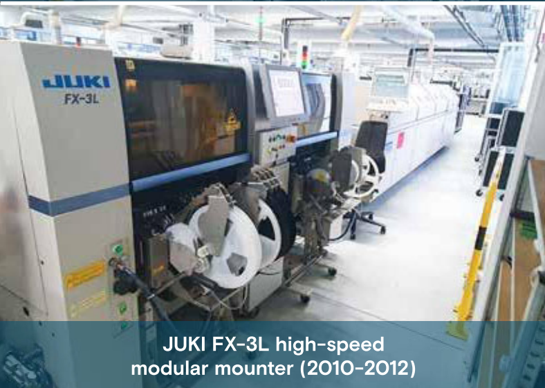
JUKI FX-3L high-speed modular mouter (2010-2012)